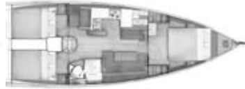
Version C Forward Owner's cabin 2 aft cabins / 1 head (Dressing + furniture with private sink in forward cabin, in option)