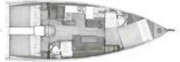
Version D Forward Owner's cabin 2 aft cabins / 2 heads