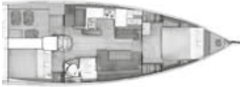
Version A Forward Owner's cabin 1 aft cabin / 1 head (Sink-dressing in forward cabin, optional)