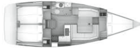
Version B 1 forward cabin, 2 aft cabins, 1 head compartment